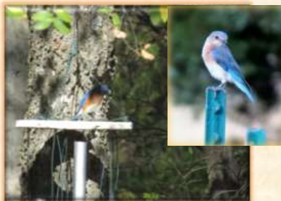
Eastern Blue Bird