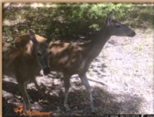
Two Deer at Feeder