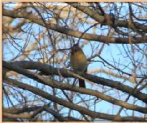
Female Northern Cardinal