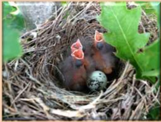
Northern Cardinal Nest