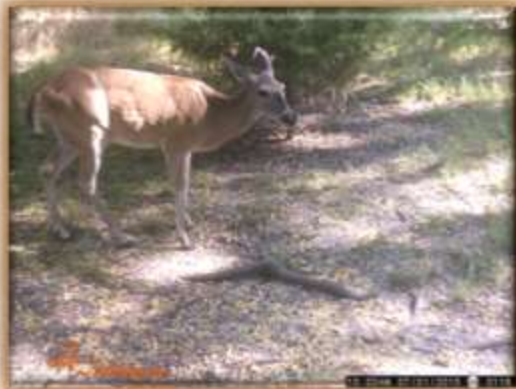
Young Buck at Deer Feeder