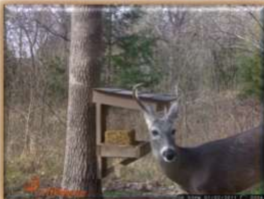
Young Buck at Mineral Block