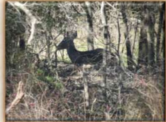
Resting in Woods Near House