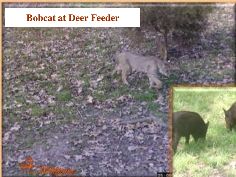
Bobcat at Deer Feeder