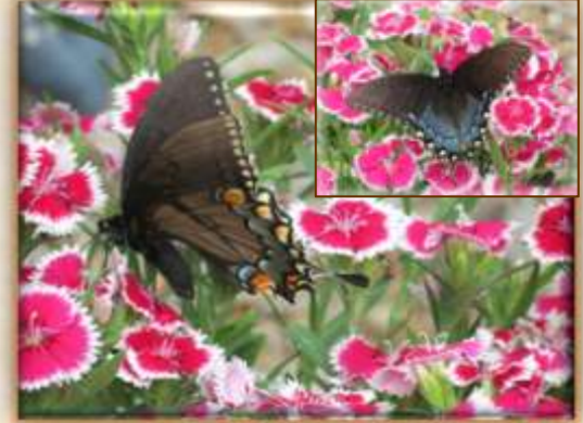
Tiger Swallowtail Butterfly