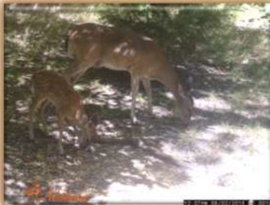
Mother and Doe at Feeder