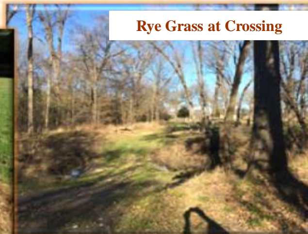
Rye Grass at Crossing