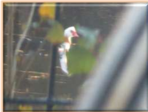
Lone Duck at Pond