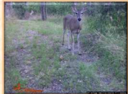
Mother and Doe Near Crossing