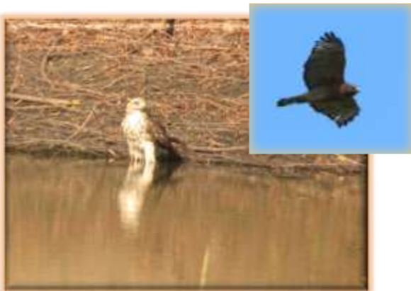
Hawk at Pond and Mid-Air