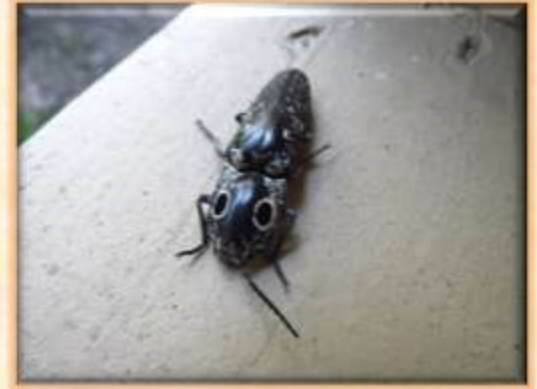
Eyed Click Beetle