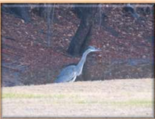
Blue Heron at Pond