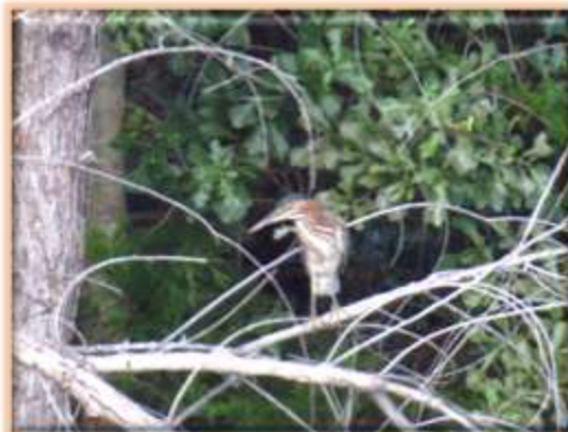
Least Bittern at Pond