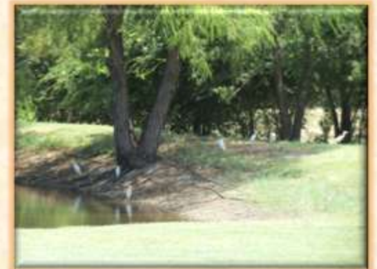
Egrets at Pond