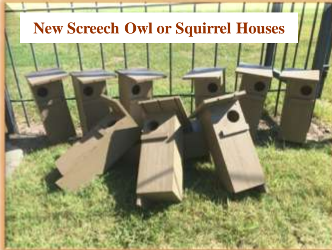
New Screech Owl or Squirrel Houses