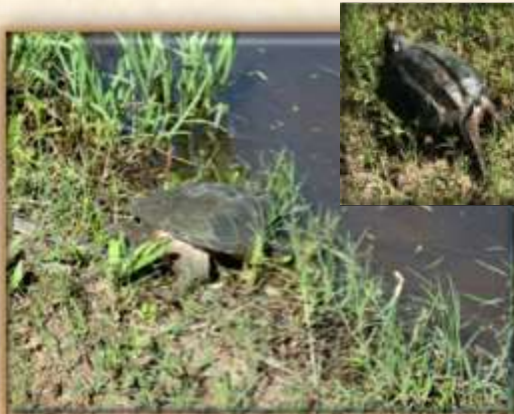
Turtle at Pond