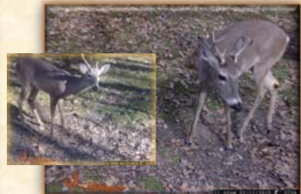
Young Bucks at Corn Feeder