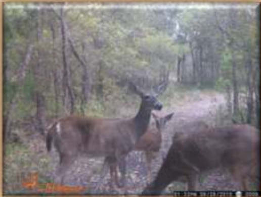
Deer at Back Trail