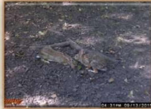
Eastern Cottontail Rabbits