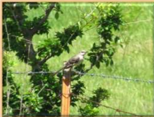
Mockingbird: Texas State Bird