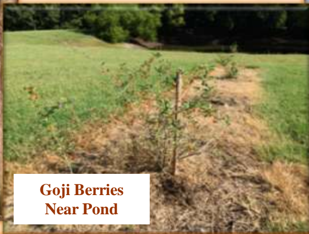
Goji Berries Near Pond