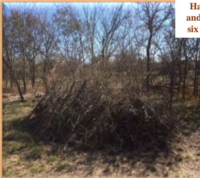
Have established and/or maintained six Brush Shelters