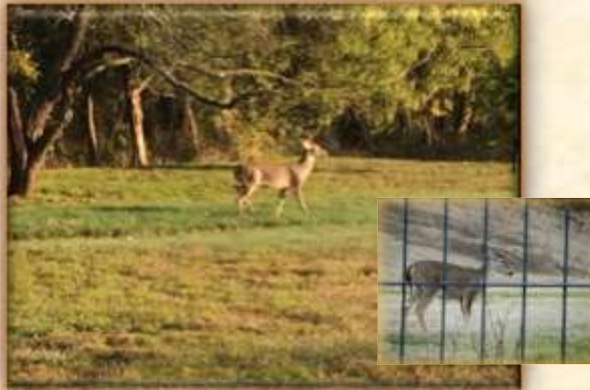
Single Deer Near the Pond