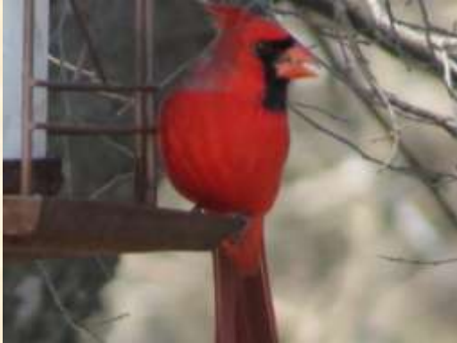
Male Northern Cardinal