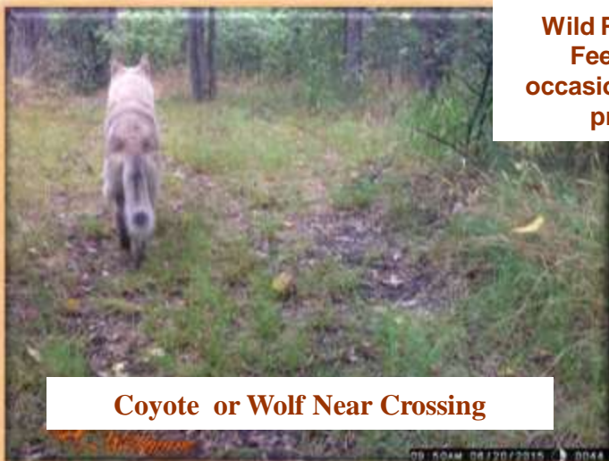
Coyote or Wolf Near Crossing