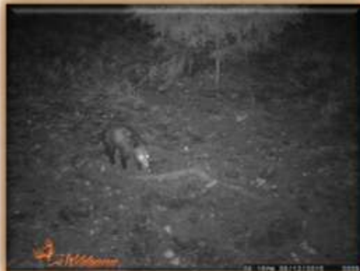
Opossum at Deer Feeder