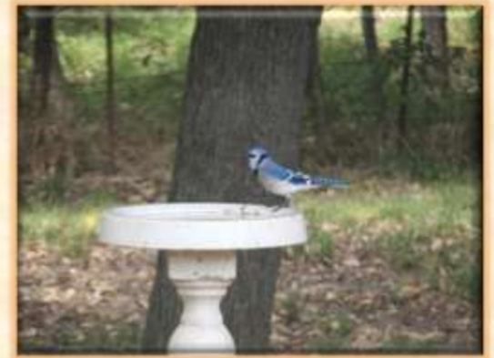
Blue Jay at Bird Bath