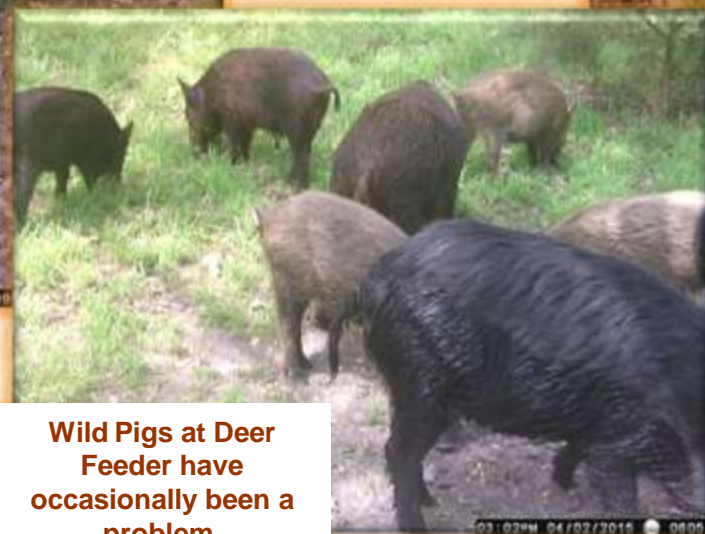
Wild Pigs at Deer Feeder have occasionally been a problem.