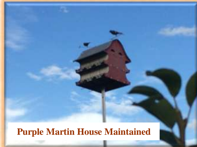
Purple Martin House Maintained