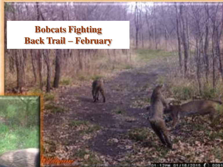
Bobcats Fighting Back Trail - February