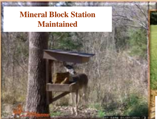
Mineral Block Station Maintained