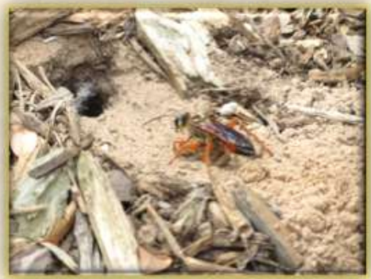
Great Golden Digger Wasp