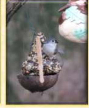
Downy Woodpecker and Tufted Titmouse