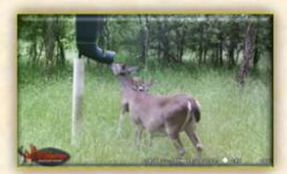
Deer Expecting - May