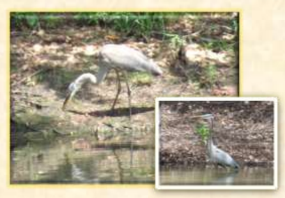
Heron at Pond