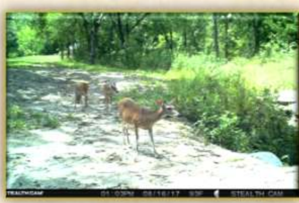
Deer at Crossing - August