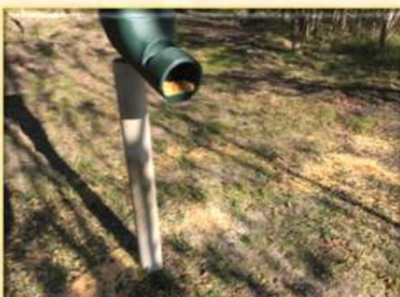
Corn Feeder Maintained

← Back area planted with oats, turnips, butterfly mix and annual rye grass.