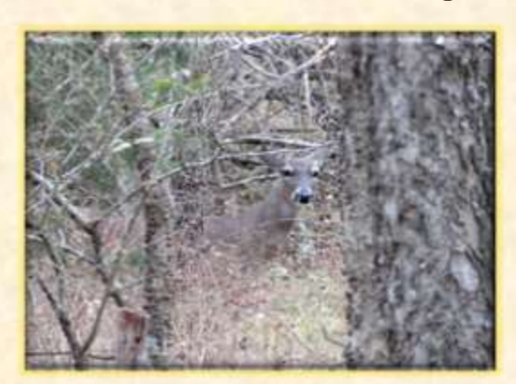
Watching from Woods near House