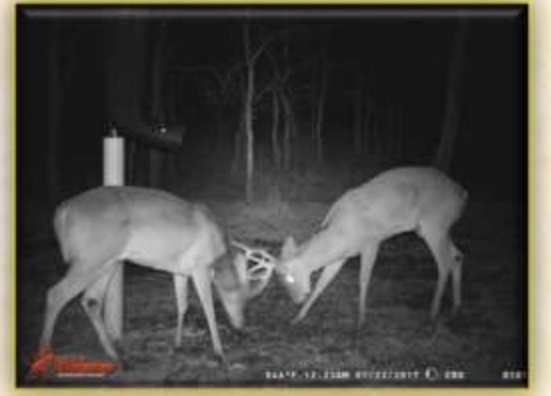
Young Bucks at Feeder