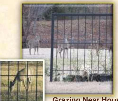
Grazing Near House