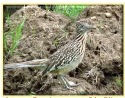
Greater Roadrunner on Dirt Pile