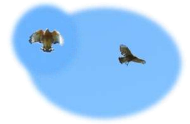
Hawk Near Pond