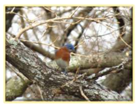
Eastern Blue Bird