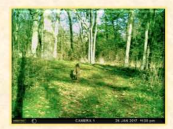
Bobcat on Trail