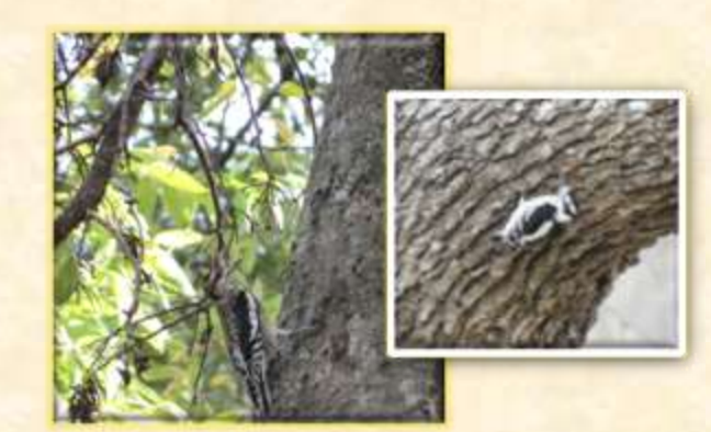
Ladder-backed and Downy Woodpecker