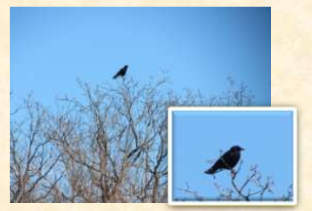
Crow in Tree Top at Pond