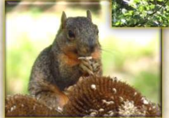
Squirrel Eating Sunflowers