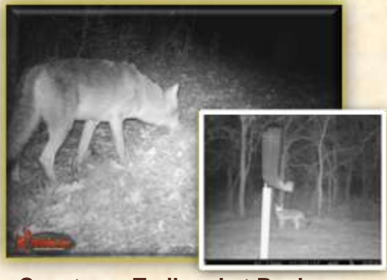
Coyote on Trail and at Back