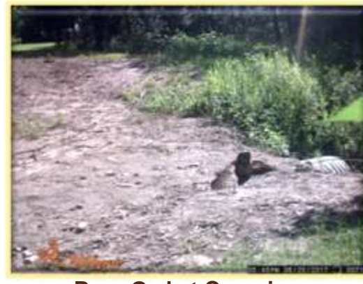
Barn Owl at Crossing