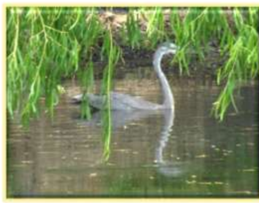
Great Heron on Pond