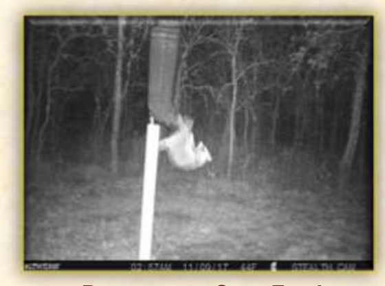
Raccoon on Corn Feeder