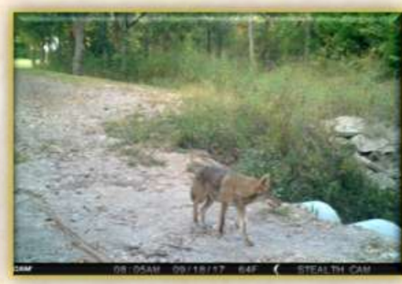
Coyote at Crossing