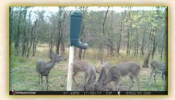
Group of Deer at Feeder