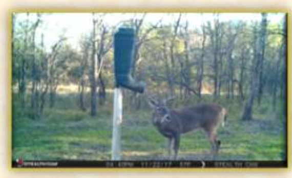
Deer at Feeder