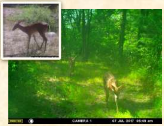
Fawn on Trail & at Crossing