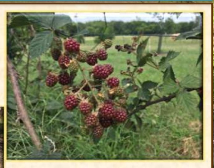
Blackberries Near Pond

← Back area planted with oats, turnips, butterfly mix and annual rye grass.