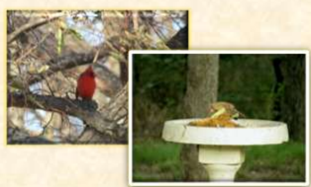
Male and Female Cardinal