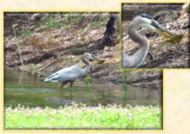
Great Blue Heron with Fish