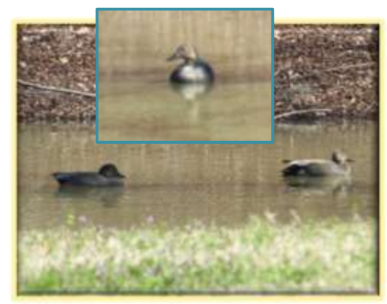
Ducks at Pond