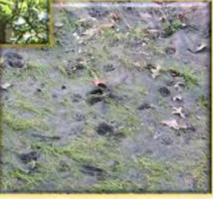
Tracks at Crossing