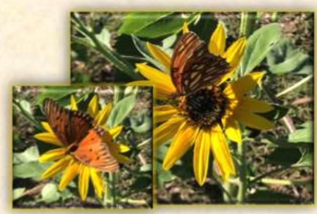
Gulf Fritillary Butterfly