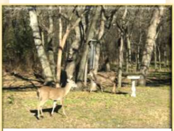
Young Deer Grazing