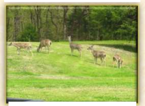
Deer Herd at Pond