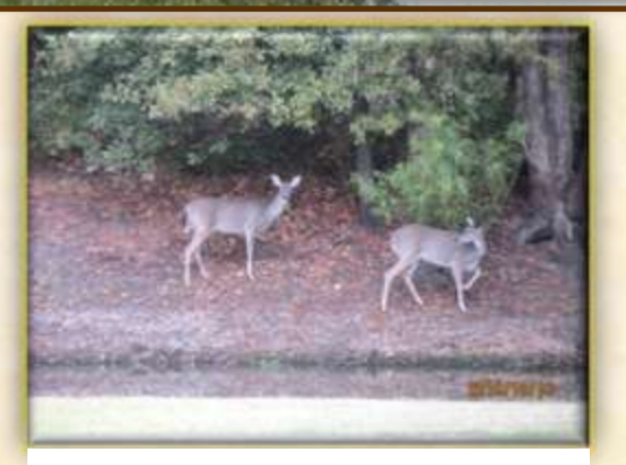
Two Does at Pond