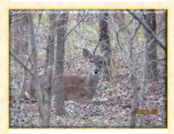
Deer Resting in Woods