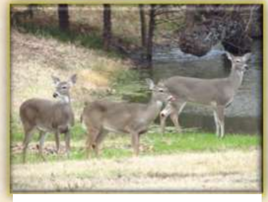
Female Deer Near Pond