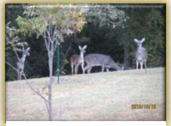
Group of Deer Near Pond