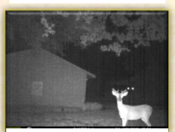
Buck Near House at Night