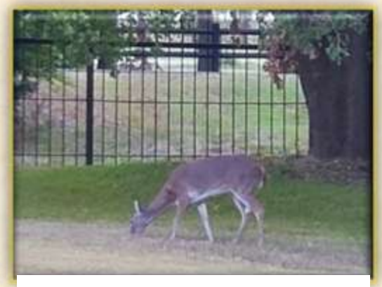
Doe in Front Yard