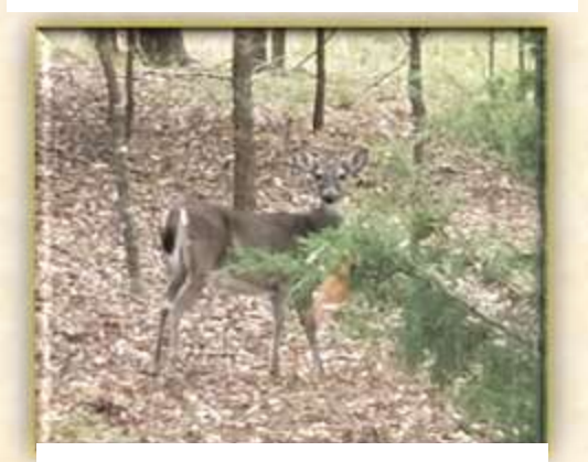
Deer at Edge of Woods