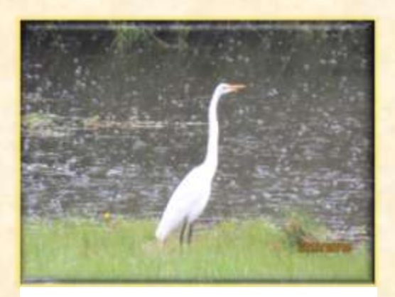
Great Egret at Pond