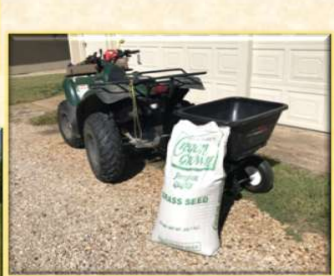
← Back area planted with bee and pollinator seed mix.