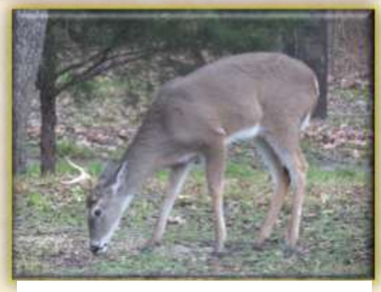
Buck at Edge of Woods