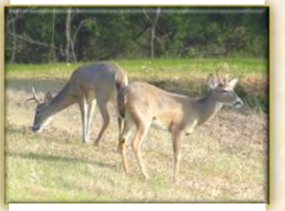
Two Bucks Near Pond