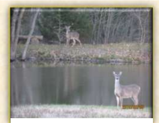
Deer on Sides of Pond