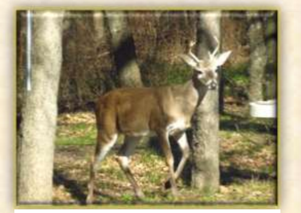
Buck at Side Yard