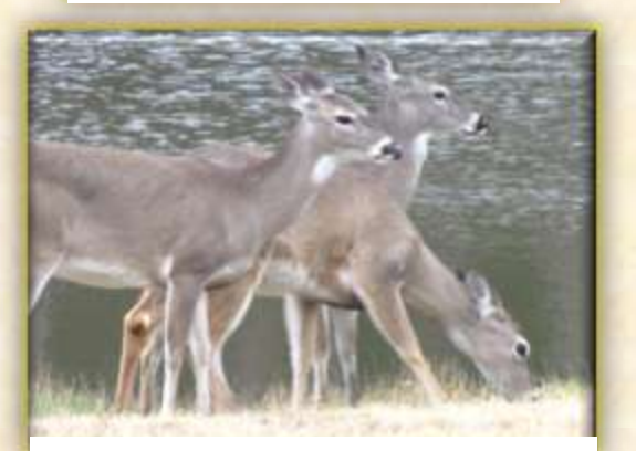
Does at Pond